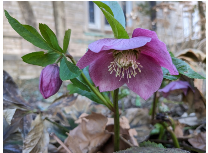
Pink Lenten rose blooming in time for the season